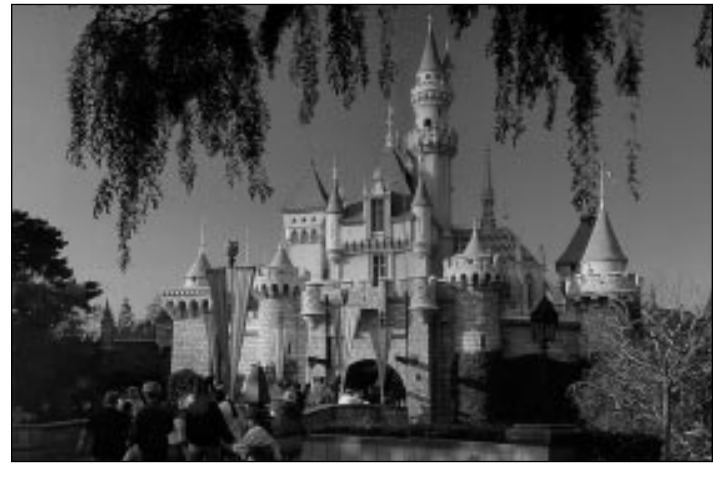
Second Annual Meeting of the Joint Section on Cerebrovascular Surgery is to be held in Anaheim, California, Feburary 4-6, 1997